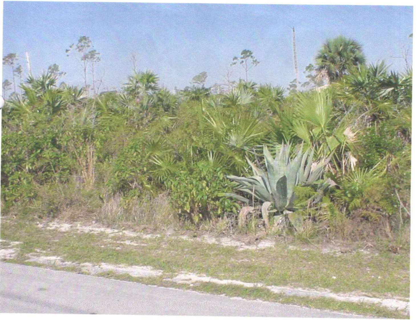
FRONT VIEW OF LOT