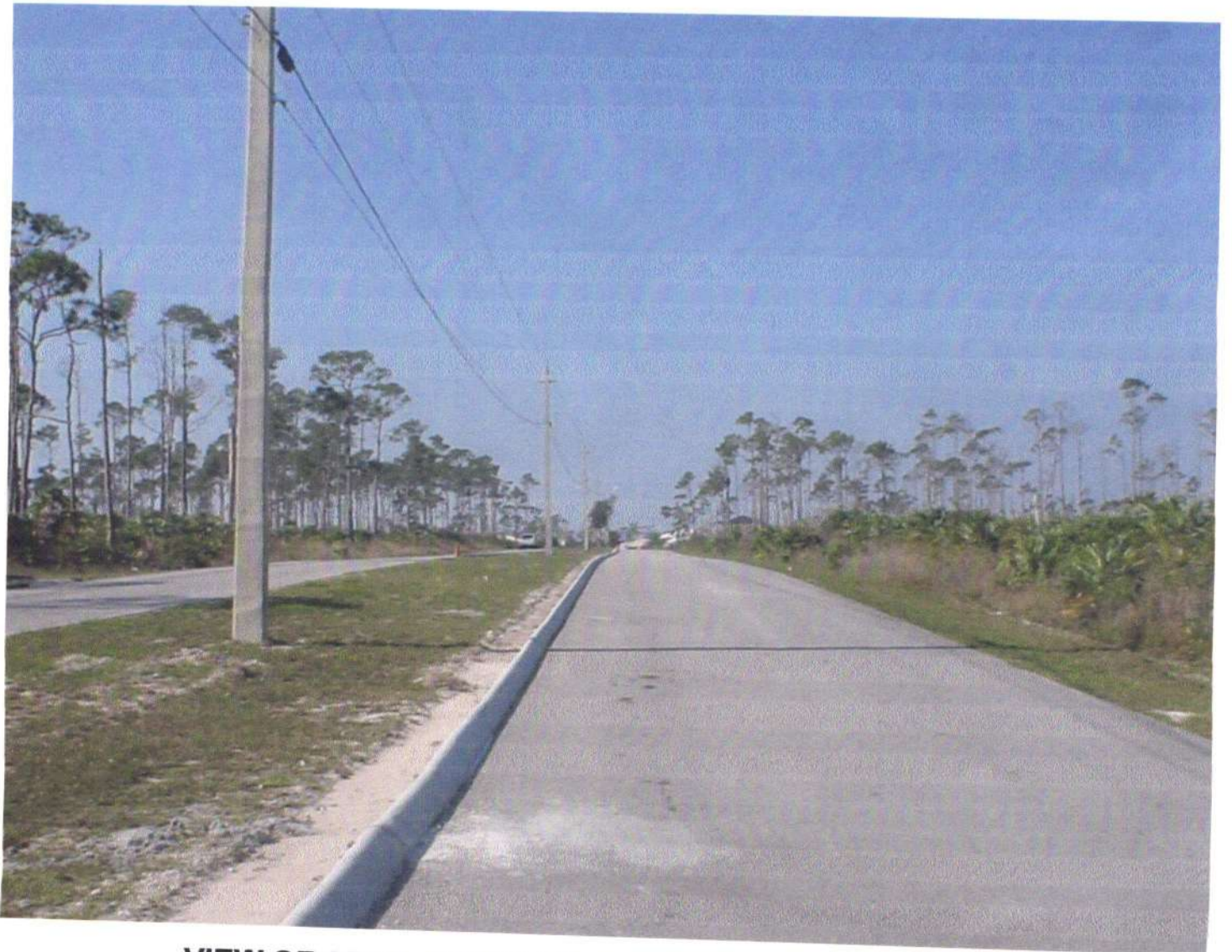
VIEW OF AREA (LOT 7, BL. 5, BAHAMIA WEST REPLAT)